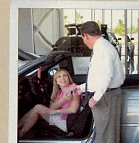
Best Car Dealership: Weber BMW