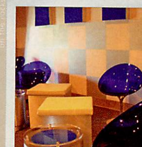
Best Night Club: on the rocks