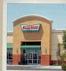
Best Doughnuts: Krispy Kreme