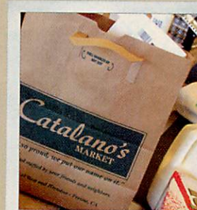
Best Grocery Store: Catalano's Market