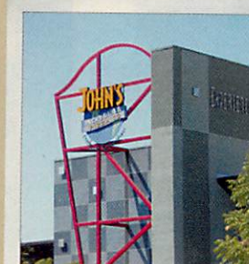
Best Family Restaurant: John's Incredible Pizza