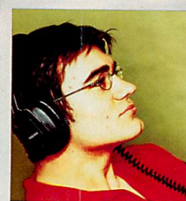
Best Music Store: Tower Records