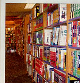
Best Book Store: Borders

BEST WEEKEND GETAWAY: SAN FRANCISCO CARMEL/MONTEREY YOSEMITE