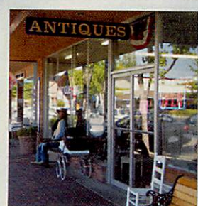
Best Antique Store: Clovis Antique Mall